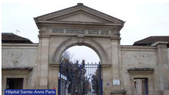
Hôpital Sainte-Anne Paris