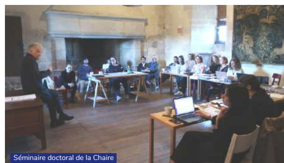
Séminaire doctoral de la Chaire

Since January 2016, the Chair in Philosophy at the Hospital has expanded its scope, working with various hospitals and care facilities. It is currently working with the GHU-Paris, Psychiatry & Neurosciences, which includes the Parisian psychiatric institutions of Sainte-Anne, Maison Blanche, and Perray-Vaucluse.