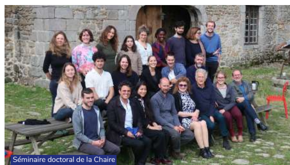
Séminaire doctoral de la Chaire